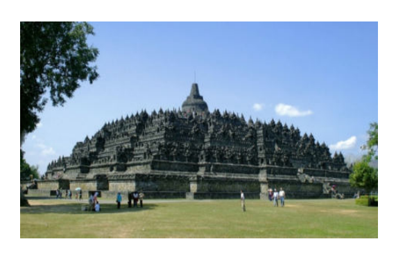
The Biggest Buddhist Temple in TheWorld: Borobudur Temple

Komodo Island – Labuan Bajo, NTT: Komodo Dragon